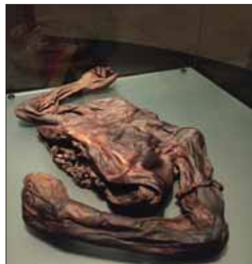
A PRESERVED Iron Age bog body on display at the National Museum of Ireland.

visit the pubs in Temple Bar where music roars on day and night.