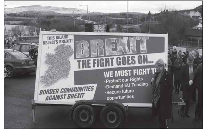
SINN FEIN deputy leader Michelle O'Neill attends the unveiling of a Border Communities Against Brexit poster in Carrickcarnon.