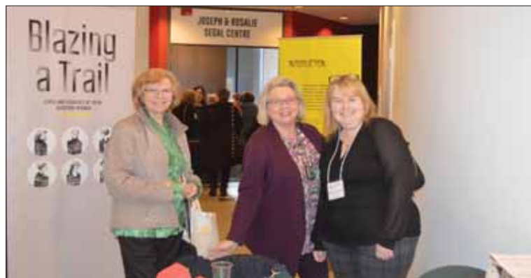
A TEAM OF VOLUNTEERS with the Irish Women's Network of B.C. welcomed participants to the event and directed participants to their respective workshops and rooms.