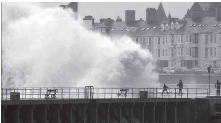
ABERYSTWYTH seafront in Ceredigion, Wales is battered with gigantic waves from Storm Dennis on Saturday, February 15.

It was estimated that more than 40,000 travellers were affected by the disruption on air, rail and road networks and more than 700 homes in westerly Cornwall were left without power.