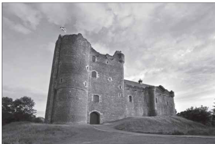
DOUNE CASTLE, a medieval courtyard fortress built around 1400 by Robert Stewart, Duke of Albany, stands in for Castle Leoch in the "Outlander" TV series.

kilts or play bagpipes; the whole culture was extinguished."