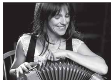
SHARON SHANNON plays The Rogue on Sunday, March 8.