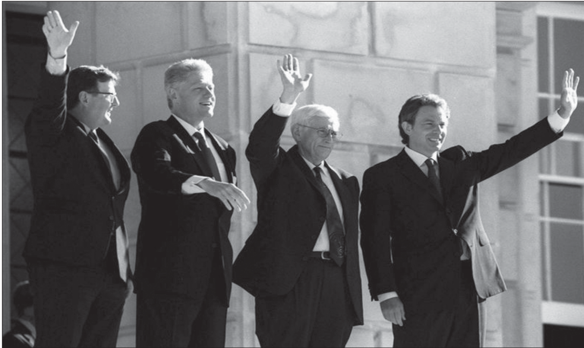
SEAMUS MALLON leader of the SDLP and deputy first minister of the Northern Ireland Assembly is pictured (third from left) on the front steps of Stormont Castle with (L-R) First Minister David Trimble, U.S. President Bill Clinton and British Prime Minister Tony Blair in 2000.

BELFAST – Seamus Mallon, an architect of the Northern Ireland peace process who served as deputy first minister, passed away on January 24, 2020 in Co. Armagh at the age of 83.