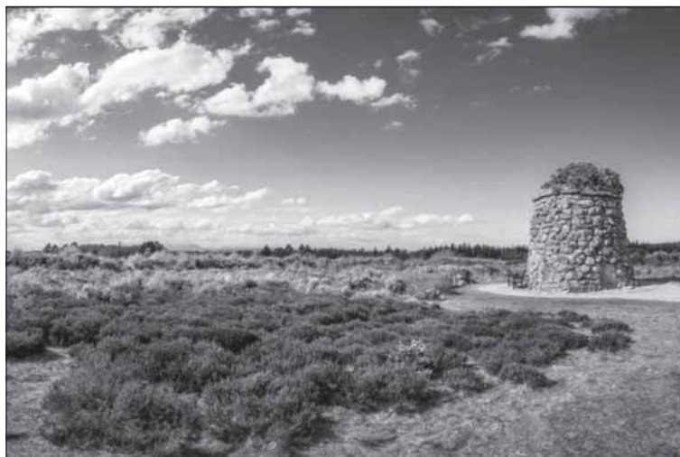
THE MEMORIAL CAIRN at Culloden Battlefield, near Inverness. There are also memorial stones for the various clans that fought there.