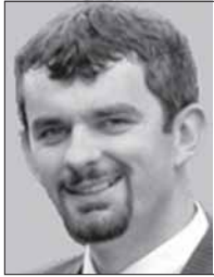
By MAURICE FITZPATRICK

THE threat that forced the two biggest parties to return to the Northern Ireland Assembly in January was the prospect of an assembly election if they did not.