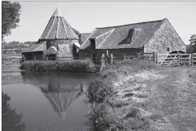
WITH ITS CONICAL ROOF, Preston Mill is unusually shaped. In the show, Jamie hides under the wheel.

After the loss to the English, Scots "were not permitted to speak Gaelic, and in the Highlands that's all they spoke. They wouldn't let them wear