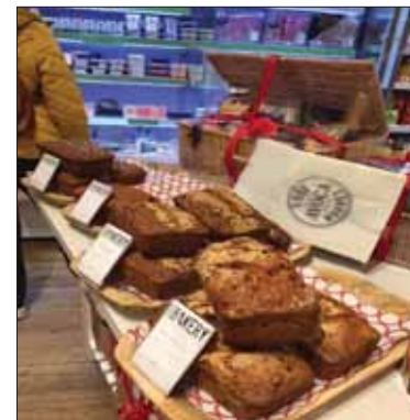
DELICIOUS baking on display at Avoca Food Market in Dublin.

Dublin is fairly compact, so walking and buses during the day, and taxis in