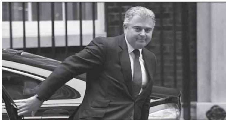
BRANDON LEWIS was appointed new Secretary of State for Northern Ireland by Boris Johnson on February 13 following the prime minister's cabinet shuffle.

Lewis was named new Secretary of State for Northern Ireland by Prime Minister Boris Johnson on February