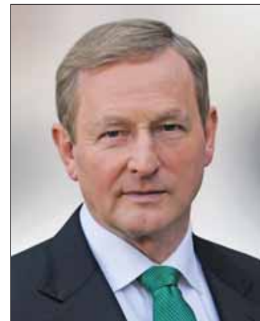
FORMER Irish Taoiseach Enda Kenny will be in Seattle to serve as Grand Marshal of the St. Patrick's Day Parade on Saturday, March 14