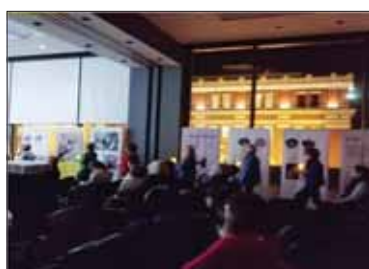
THE EVENING event opened with a procession of women bearing light accompanied by evocative background music.

now underway to continue the readings with an ever-growing group of women joining the readings.