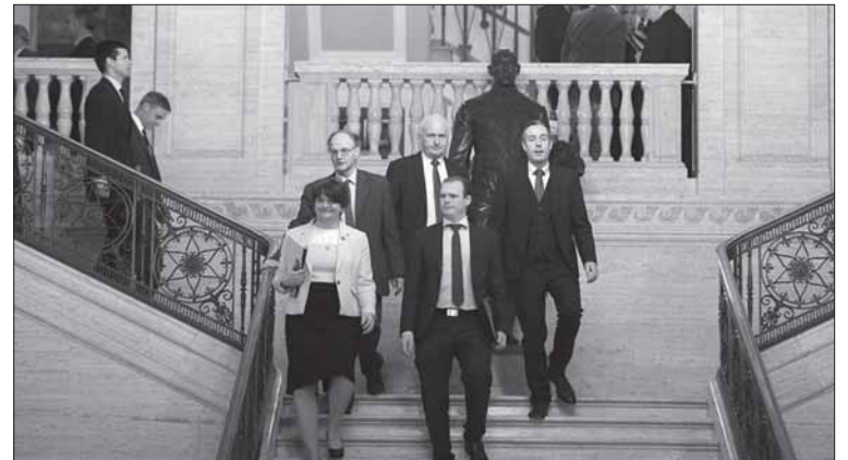
ARLENE FOSTER of the DUP leads her party into the chamber at the Parliament Buildings. She has been reappointed first minister.