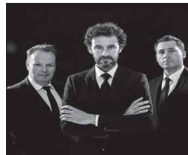
THE CELTIC TENORS will perform at The Orpheum Theatre on March 27 and 28.

To the surprise of all witnesses, they were signed on the spot to an international record deal. The trio has now released five albums, sung leading roles