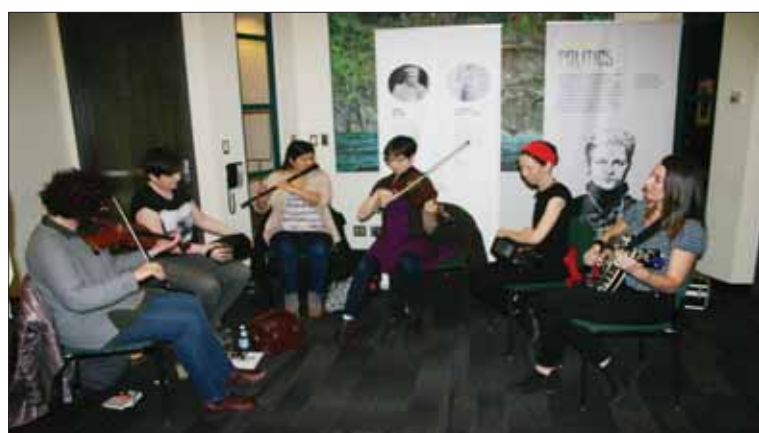
A RECEPTION followed the evening presentation with a talented group of all-women traditional session musicians providing the wonderful background music.