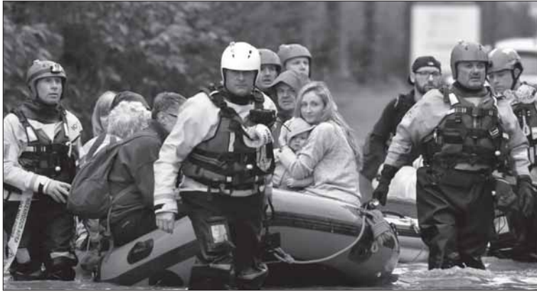
IN SOUTH WALES, residents of Nantgarw in a rescue boat being evacuated by emergency teams.

THOUSANDS were left without power on Sunday, February 16 after Storm Dennis swept across the UK and the Republic of Ireland, bringing heavy rains and strong winds.