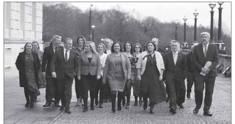
SINN FEIN returns to devolved government with Stormont leader Michelle O'Neill becoming deputy first minister.