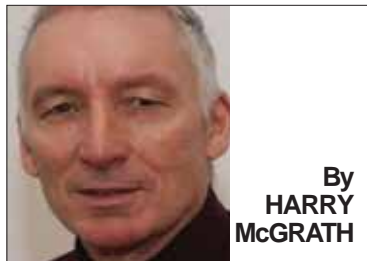
By HARRY McGRATH

EDINBURGH – Looking for news stories from western Canada in the British media is like watching for a blue moon, but with less expectation of success.