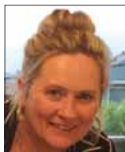
By MAURA DE FREITAS

The letters covered a wide range of experiences and in the course of advance preparation the group participants formed a close bond. Plans are