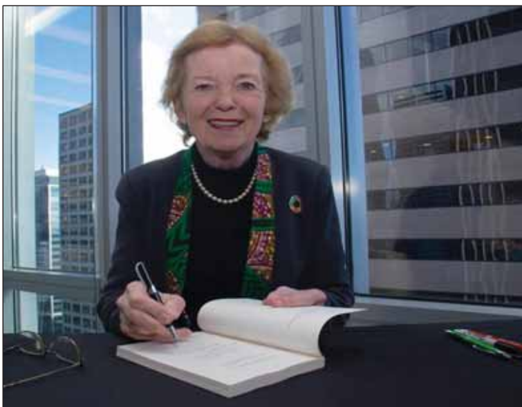
FORMER President of Ireland President Mary Robinson was in Seattle on Friday, February 14 where she addressed a group on climate change and signed her new book, Climate Justice: Hope, Resilience, and the Fight for a Sustainable Future .